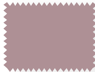
485 Rosa antico