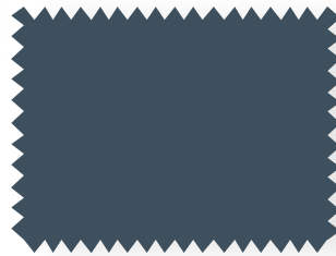
672 Orion Blue